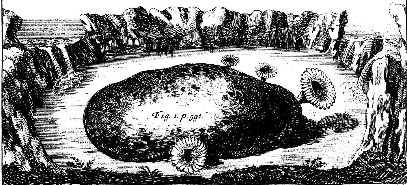
Fig. 1. p. 591.